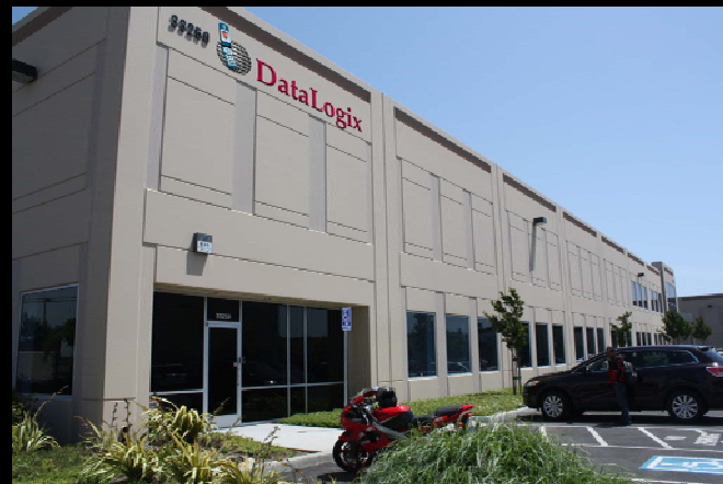
New Datalogix Facility in Union City, California