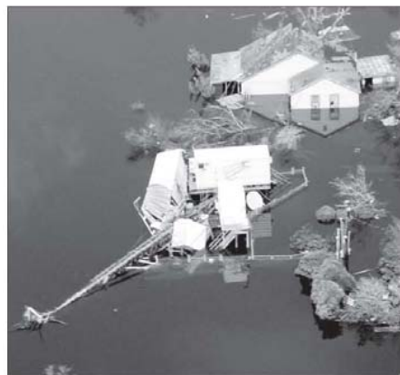
CELL tower falls on submerged home.